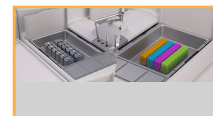
Removable trays for storage of cassettes and molds. Surplus paraffin is drained into waste, removable drawers.