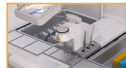
Dispensing area with touch plate or footswitch, light and forceps support